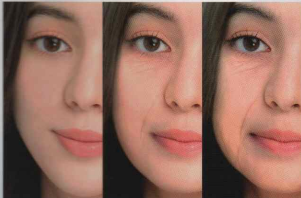
Model. Not Actual Patient

From the mid-20s, collagen loss accelerates as production decreases by 1% annually, resulting in fine lines, wrinkles, and dull, sagging skin.